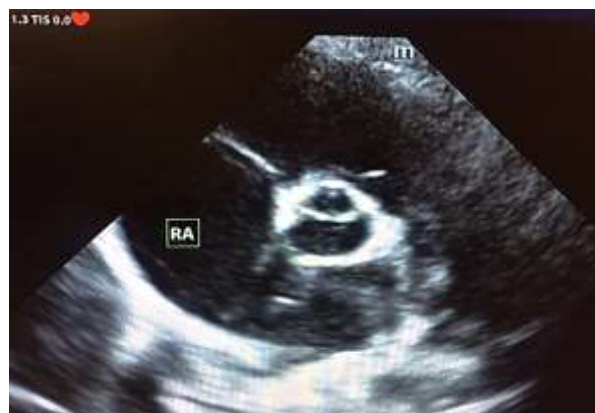
Figure 3. Parasternal short axis (PSAX) view of a four-month-old girl. Note the right atrial (RA) enlargement and large secundum atrial septal defect (ASD 2 )

Case 4: The fourth case was a five-month-old girl who was referred to our clinic due to FTT and poor weight gain. On the physical exam, she had normal S1, with fixed splitting of S2, and a systolic murmur with grade 2/6 on LSB. On ECG, she had NSR, RAD, and pure R wave in V1 in favor of RVH and in echocardiography, dilatation of RA and RV was prominent with moderate TR with 50 mmHg gradient and a large ASD 2 (size = 14 mm) and PH (Figure 3). She was referred to surgeon for operation which was done two weeks after the diagnosis. Postoperative echocardiography revealed mild TR and improving PH.