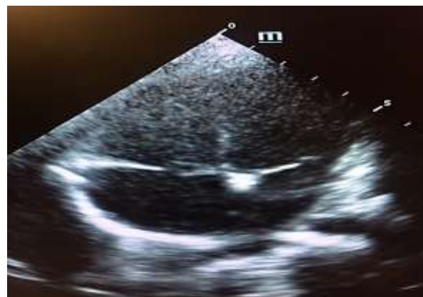
Figure 2. Apical four-chamber view of a six-month-old girl with moderate to large secundum atrial septal defect (ASD 2 ) and right atrial (RA) and right ventricular (RV) enlargement

ASD 2 (size = 10 mm) and moderate TR with 120 mmHg gradient (Figure 2). CT angiography after diagnosis ruled out any other CHD. Surgical closure was done two months after diagnosis and cease of medication and normal PAP were achieved in about three months after operation.