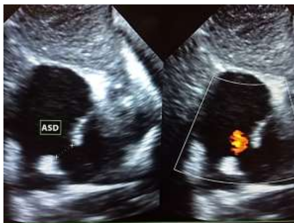
Figure 1. Subcostal coronal view of an eight-month-old girl with atrial septal defect (ASD). Note the right atrial (RA) enlargement and secundum ASD (ASD 2 )

and right ventricular hypertrophy (RVH). Echocardiography revealed a moderate to large size ASD 2 (size = 9 mm) with dilated right atrial (RA) and RV (Figure 1), moderate tricuspid regurgitation (TR) with 66 mmHg gradient in favor of PH. Computed tomography (CT) angiography was performed after diagnosis which ruled out any additional CHD. The patient had been on medication while she had surgical closure of the defect about two months after the diagnosis. PH improved after surgical ASD closure, and in one year follow-up, the patient had normal PAP and we discontinued her medication.